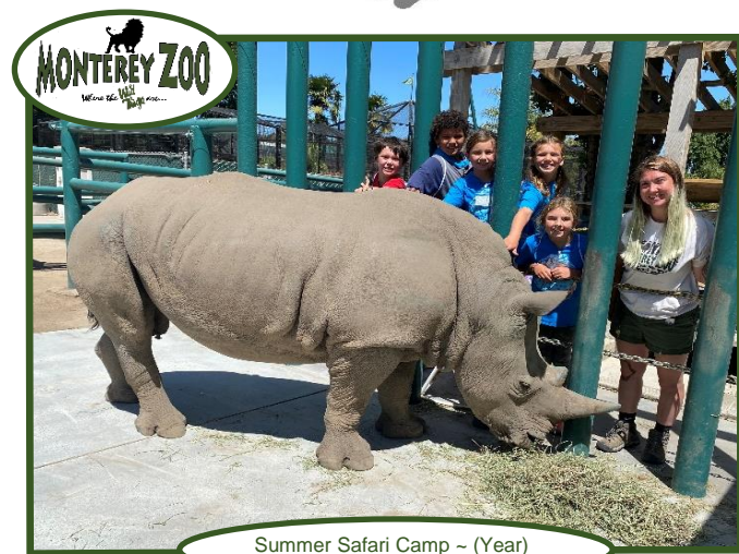
Summer Safari Camp ~ (Year)