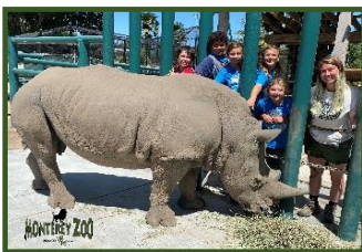
Summer Safari Camp (Year)