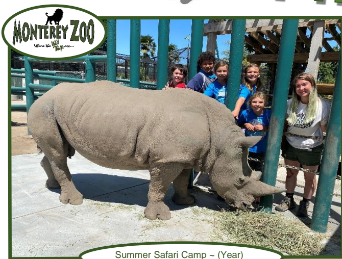
Summer Safari Camp ~ (Year)